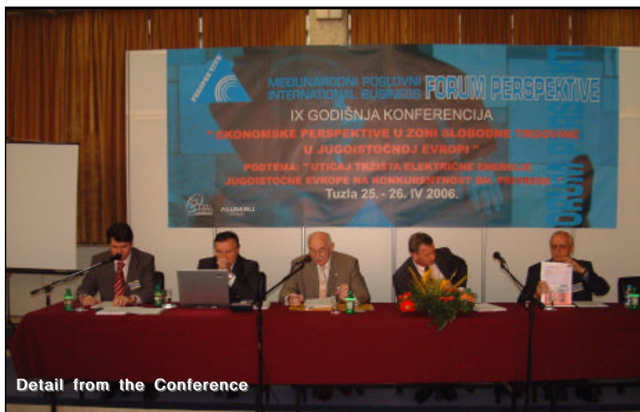
Detail from the Conference